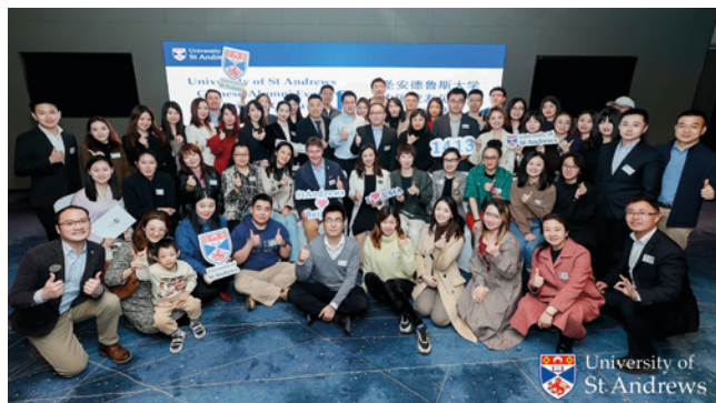
Alumni reception in Beijing

For more information and for articles from the Kaleidoscope Alumni Network visit the KAN website or connect with Kaleidoscope Alumni Network on LinkedIn .