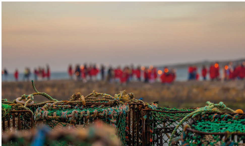
Gaudie 2024 took a different route to the lower cross pier due to storm damage on the main pier